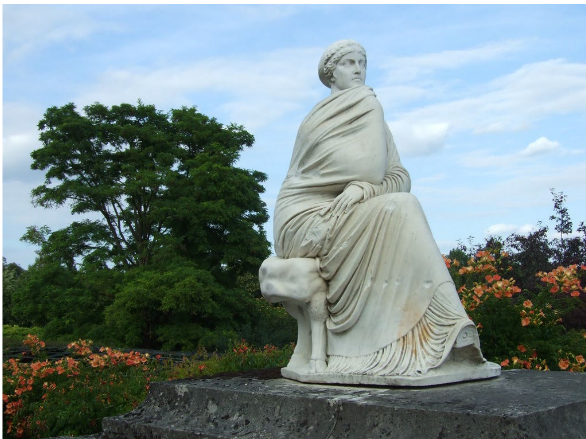
'Mnemosyne' in the Chateau de Compiègne, France