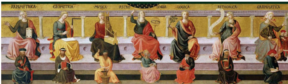
The seven liberal arts and some students

After Imperial Rome fell apart the Roman church was strong enough to survive the so-called Dark Ages. From the mid-seventh century armies from Arabia stormed across much of the former empire and into Spain bringing the religion of Islam with them. It meant two legalistic and heavily structured religions came up against each other militarily. Yet after managing to hold back the Moslem advance, in the following centuries the Christian West would forge links with Islamic scholars who were part of what is known as Islam’s intellectual and scientific Golden Age. Ideas entering Europe included translations of the work of Aristotle, Egypt’s hermetic teachings and ancient Babylonian star lore.