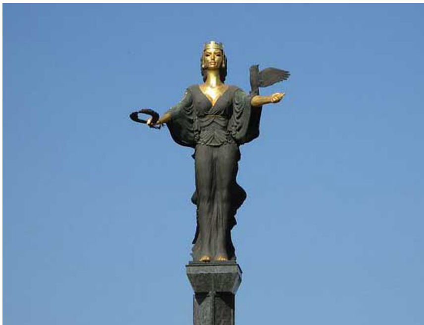
Sophia is still with us – 21 st century statue of Saint Sophia with Wisdom attributes in Sofia, Bulgaria

The legend didn’t end with death. The severed head of Orpheus continued to sing as it floated out to sea. This tells us that while memory of the beloved bride lasted, divine music resonated in human souls. Wisdom lived on, but in the underworld was bereft of the music of Orpheus – that is, wisdom became hidden beneath the dross in a human soul.