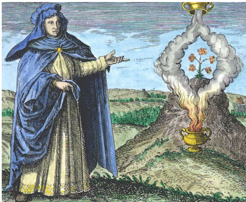
Mary the Jewess – pointing to heaven and earth united through alchemical practice; in Michael Maier's 17 th century 'Symbola Aurea Mensae'

The link between heaven and earth points to an allied and even deeper purpose of the work – the ultimate spiritualisation of matter and the whole earth into spiritual gold through the power of the Philosopher’s Stone.